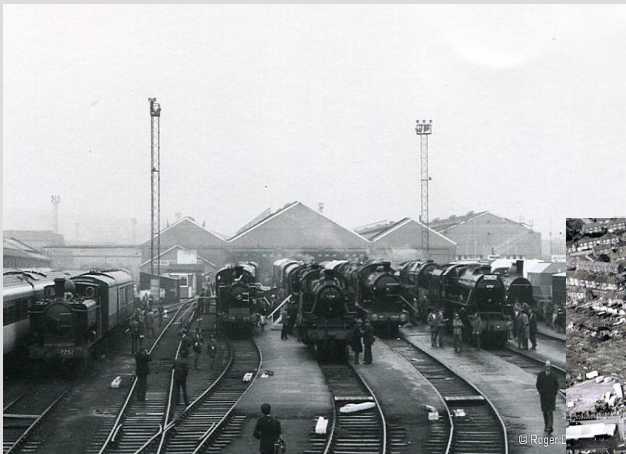
Rail 150 celebrations, aerial view 1975 and locomotives lined up outside the wagonworks in the rain!