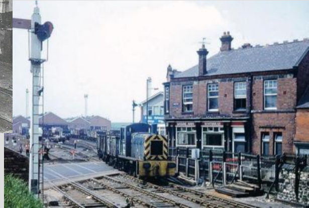
Masons Arms Crossing in 1963, with the wagonworks in the background