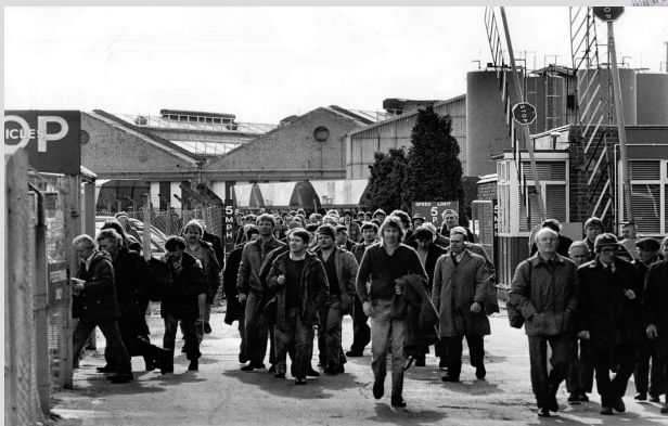
Nearing the end of the line!, men leave gates 13 th April 1982 after redundancy announcement, and NUR banner paraded in Darlington 13 th March 1983.